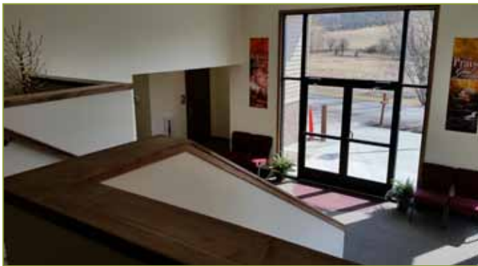
Our mostly completed new foyer.

It has not happened since 1918, but here we are! Because of state mandates the construction company working on our building renovations has been temporarily shut down and we have canceled services through the end of April. However, our ministry is very much alive and well!